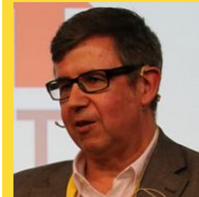
Àngel Domingo, Catalonian Government